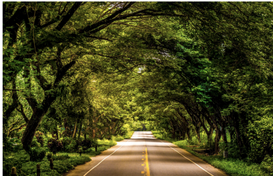
The Long Mile: Managing Chronic Pain