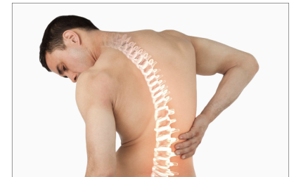
Osteopathy & Chronic Conditions

In this series of three workshops, you will learn how Acupressure can be utilized in a self-treatment approach to improve wellbeing and symptom management in patients with chronic illnesses.