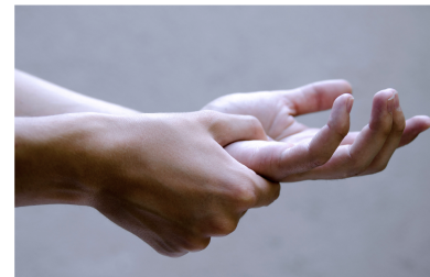
Acupressure for Chronic Illnesses

In this session, you will learn integrative health approaches to promoting immune health. These approaches can be added to public health recommendations to reduce your risk of serious viral illness.